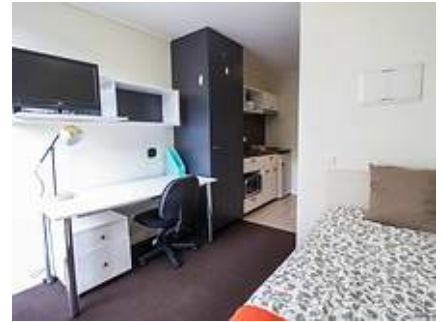
Property details continued from page 1: