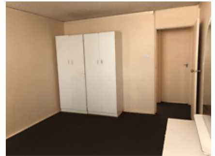
Property details continued from page 1: