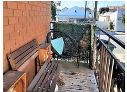
Property details continued from page 1: