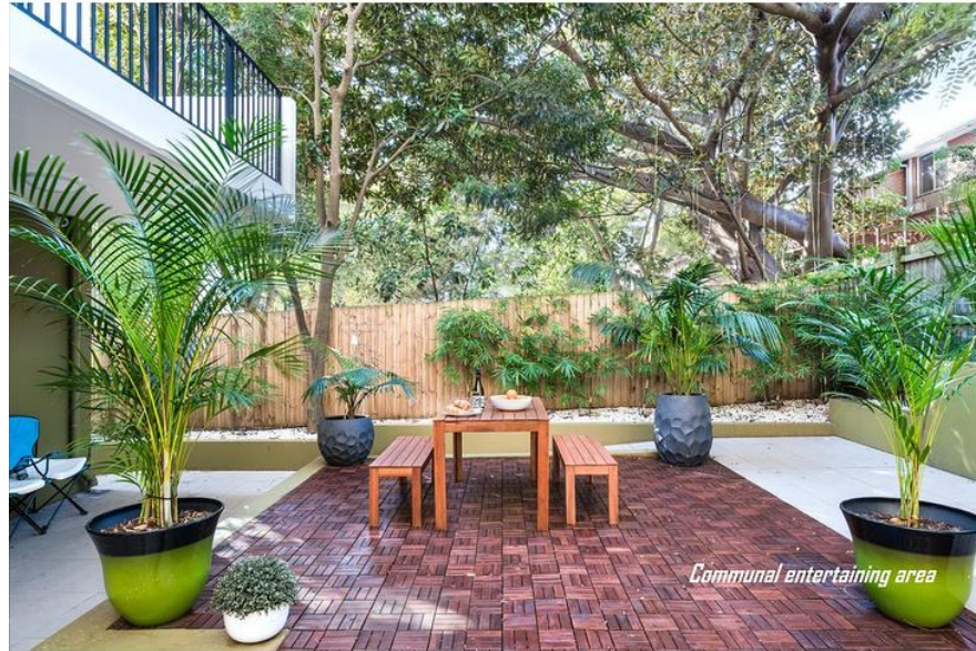
Communal entertaining area