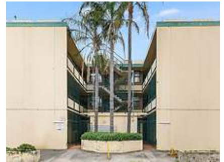
Property details continued from page 1: