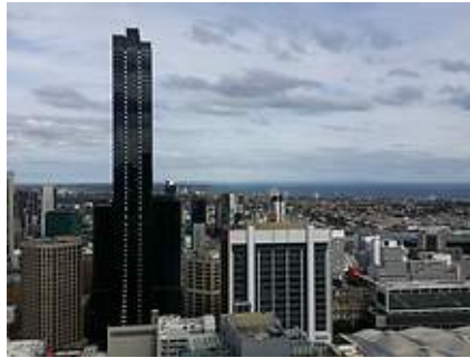
Property details continued from page 1: