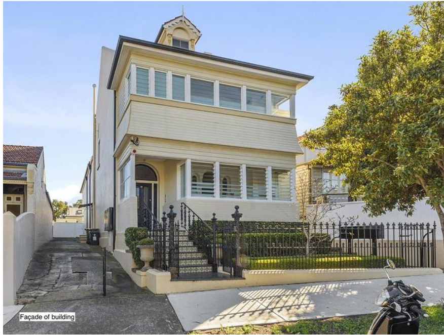
Façade of building