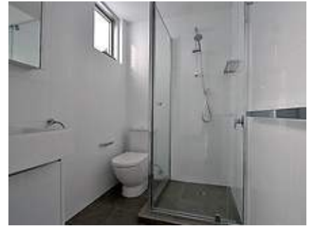
Property details continued from page 1: