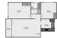
McGrath McGrath is a registered real estate agent. McGrath is not a financial adviser and does not provide financial advice. McGrath is not a financial adviser and does not provide financial advice.