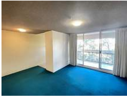
Property details continued from page 1: