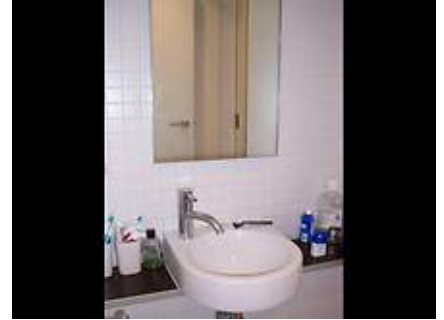
Property details continued from page 1: