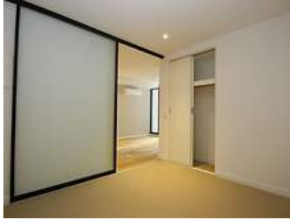
Property details continued from page 1: