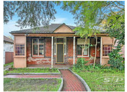
Property details continued from page 1: