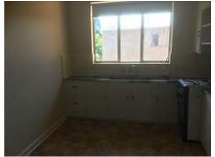
Property details continued from page 1: