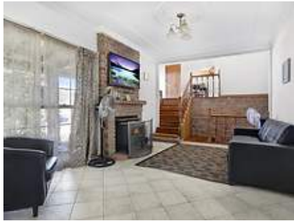
Property details continued from page 1: