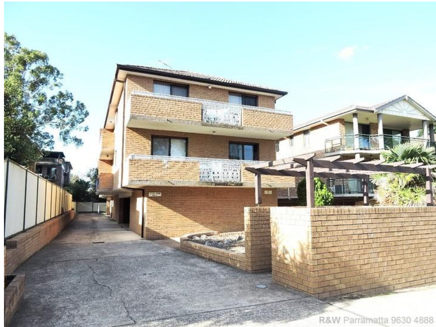
R&W Parramatta 9630 4888