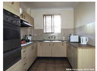
R&W Parramatta 9630 4888